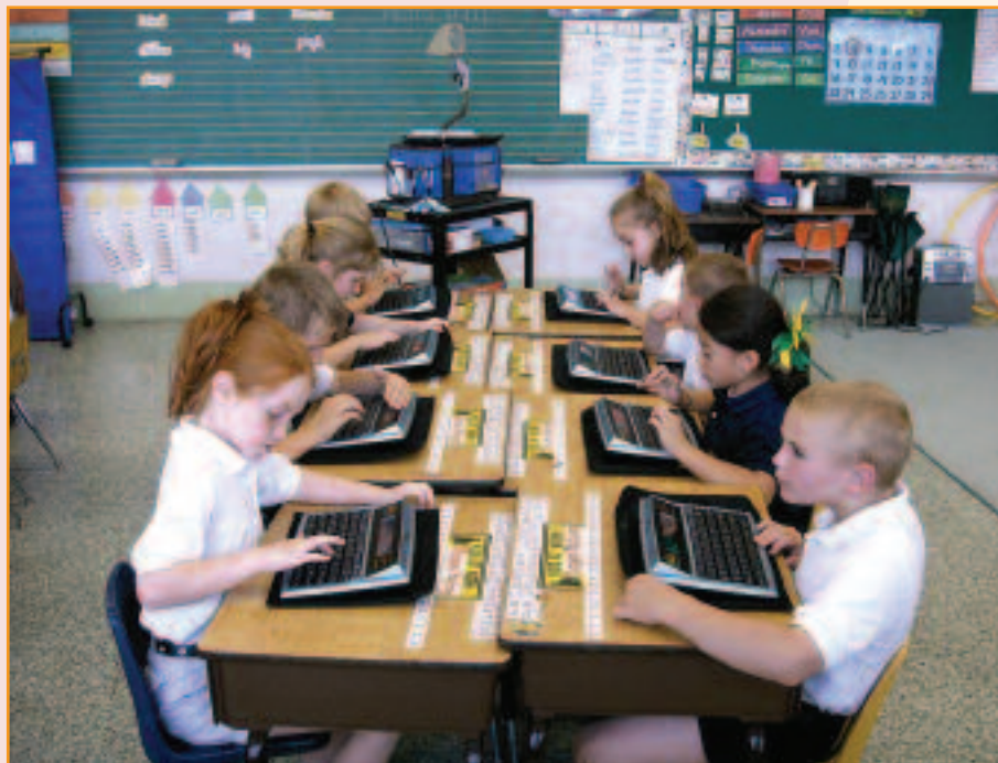
First grades at Resurrection School are busy using the technology that is integrated into their curriculum.