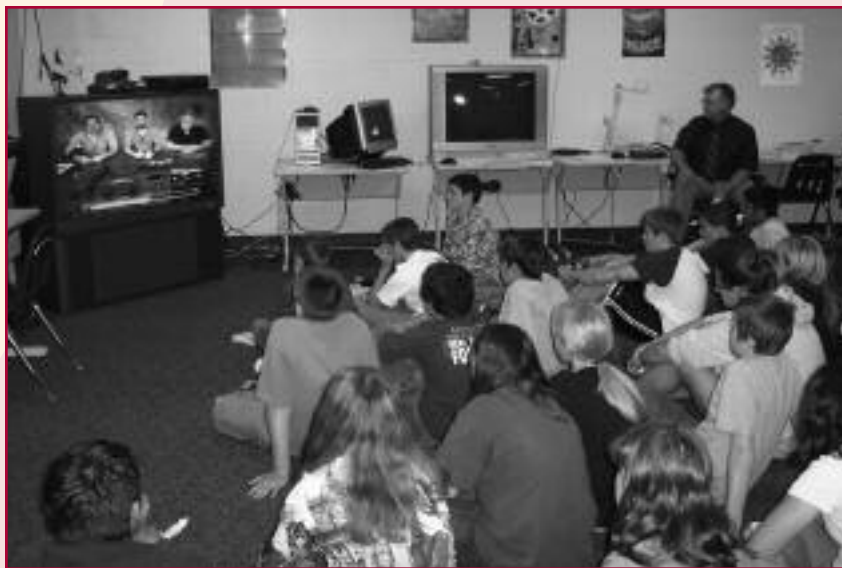
Students at Pike Central Middle School participate in the school's first electronic fieldtrip.

*** If you would like to have your school's news included in the S.I.N.E Post please mail information to S.I.N.E. Route 3 Box 12C Oakland City, IN 47660 Attn: Newsletter.